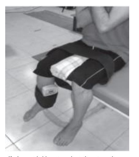
Figure 1b. Isometric hip external rotation strength measurement