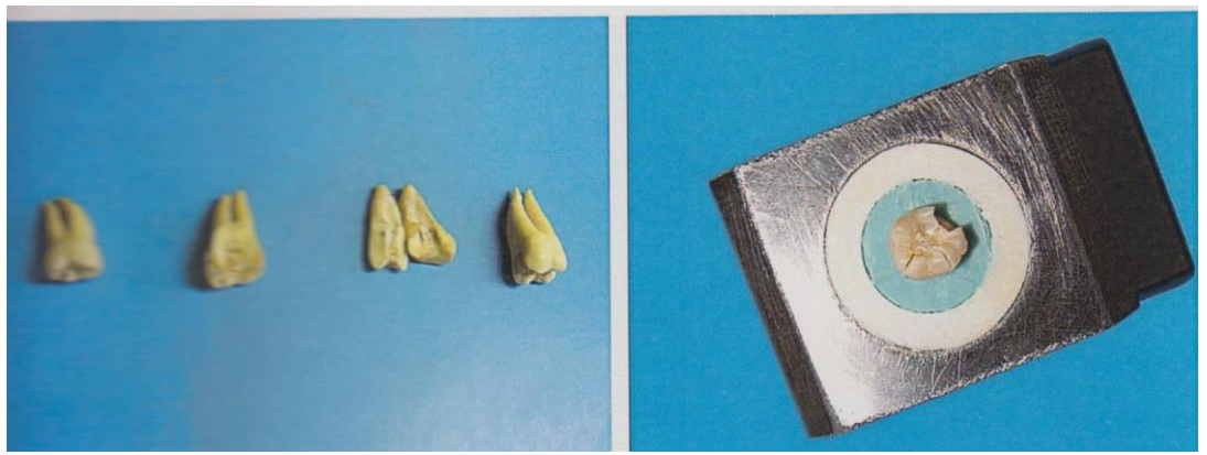
Figure 2. Teeth after perforation

The downward motion was observed in the diagram drawn by the device software (Figure 3).