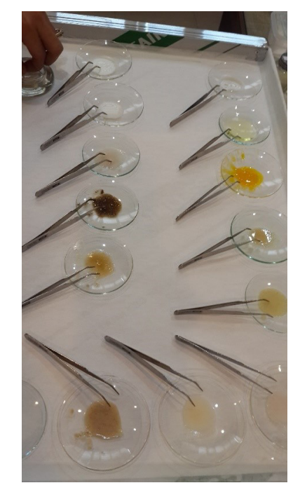
Figure 1. Prepared foods for APT test

Statistical analysis was performed through SPSS, version 20 and P value < 0.05 was considered statistically significant and the Pearson correlation coefficient was