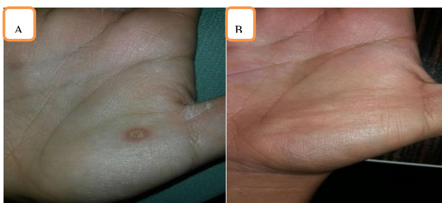
Figure 1. A: Patient 1, a single wart on the right palm before the treatment; B: Patient 1, three weeks after the treatment.