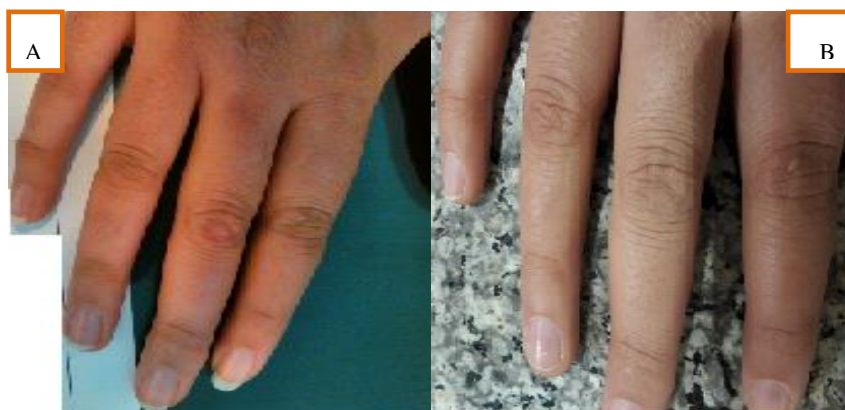
Figure 2. A: Patient 2, a wart on the middle finger of the right hand, a week after onset of the treatment; B: Patient 2, three weeks after the treatment