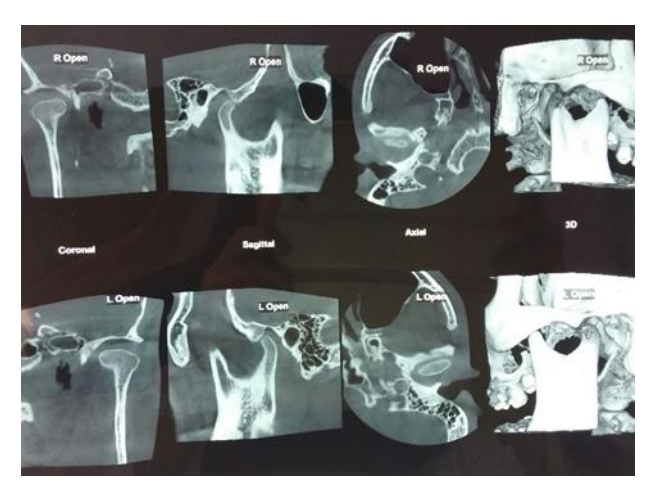
Figure 2. Sagittal, axial and coronal cone-beam CT images showing limitation of condylar movement in open mouth position.

anterior displacement of disk had been reported that had not been enough for such trismus.