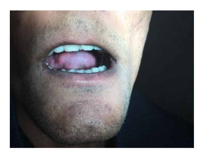
Figure1. Extraoral photograph showing reduced mouth opening

A 23 year- old man with a complaint of progressive difficulty in opening his mouth over the past 6 months is presented that conservative treatment had failed to decrease his symptoms (Figure 1). His dentist had done various investigations such as cone beam computed tomography (CBCT) and ultrasonography to rule out temporomandibular diseases and fractures (Figure 2, 3).