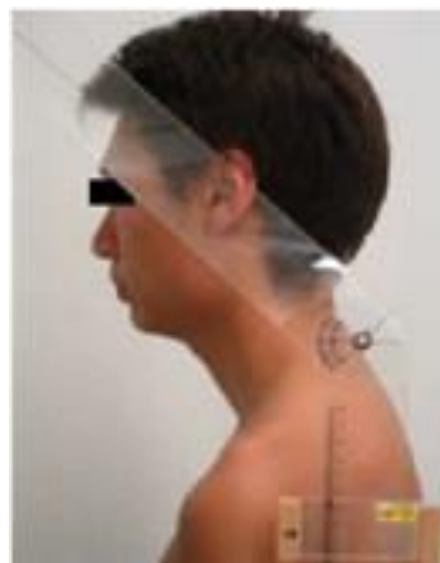
Figure1. Measurement of CV angle

Forward head posture was measured using head posture spinal curvature instrument (HPSCI, Wilmarth, 2002). For this purpose, participants were asked to stand in a comfortable position and perform the neck flexion and extension exercises for 3 times to ameliorate abnormal muscle condition. Then, they were asked to put their head and neck in a normal position and forward head posture was measured (Figure 1). At this stage, the examiner stood to the left side of the participant, fixed the stationary arm of the goniometer in a position perpendicular to the ground, the axis of the goniometer in the side parallel to the spinous process of C7, and the moveable arm of the goniometer on the anterior ear cartilage (Tragus). The angle between the moveable arm and the horizontal line passing through C7 was recorded as the craniovertebral (CV) angle. The examiner regarded the number closer to the hand of goniometer as the CV angle and if the hand of goniometer was placed between two numbers, the smaller one would be recorded. The measurement was repeated for three times for each. A two-minute rest between each test was given to the participant. At the end, the average of three measures was recorded as the CV angle for each participant. The smaller CV angle shows greater forward head posture (16).