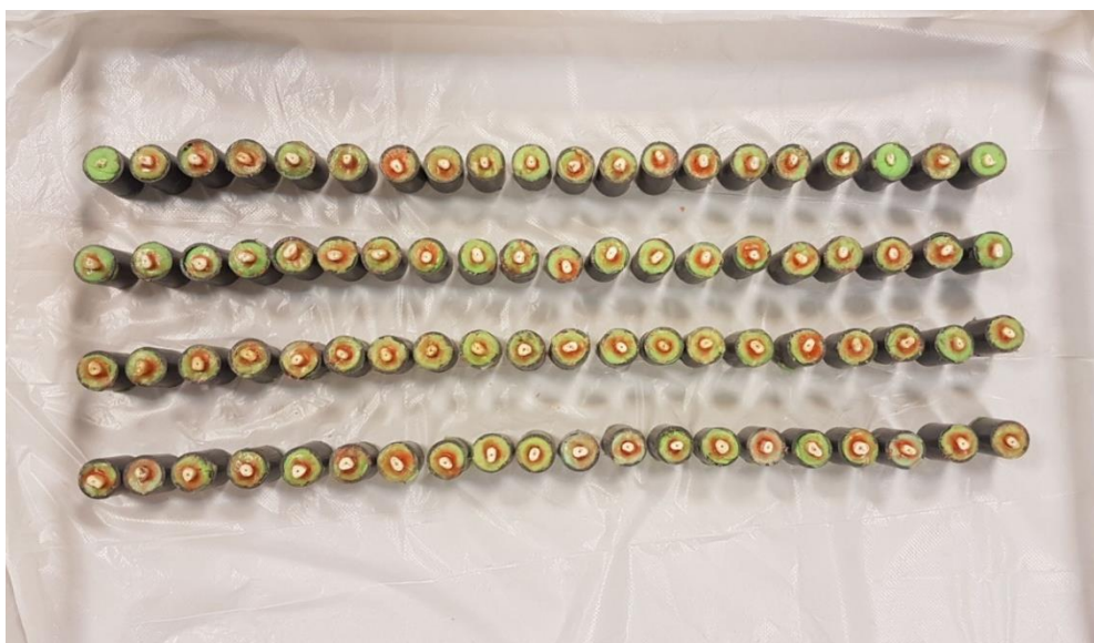
Figure 1. Prepared samples mounted in acrylic resin cylinders

The specimens were stored at 37°C and 100% humidity for 1 week. After this period, the middle third of each root was coated with uniform thickness of light body rubber base (Impregum F, ESPE, Seefeld, Germany) to provide a simulated periodontal ligament and then was embedded in acrylic resin cylinder using self-cured acrylic resin (Heraeus Kulzer, Dormagen, Germany) except for the coronal 4 mm (Figure 1).