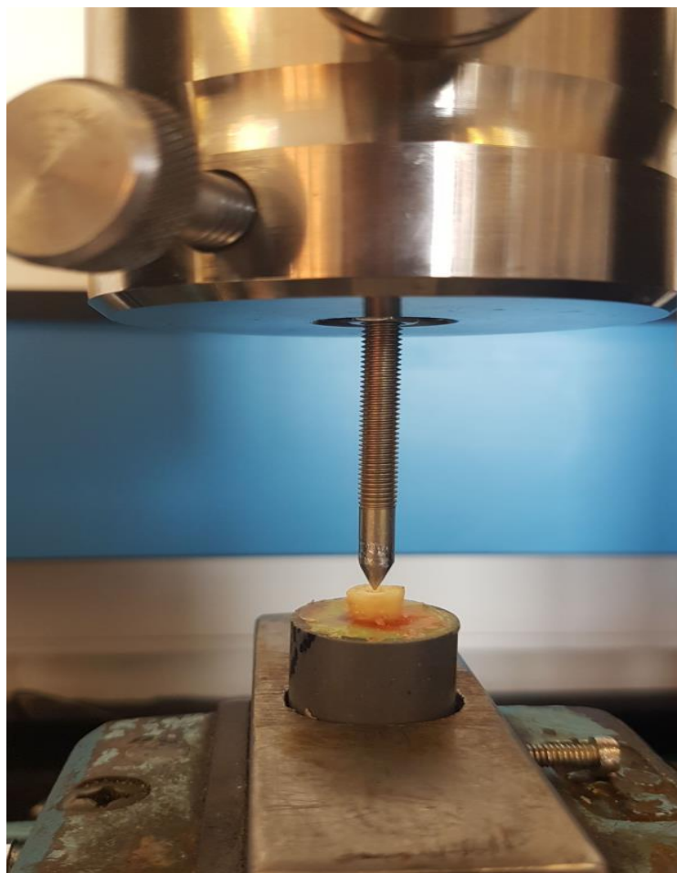
Figure 2. Universal testing machine for compressive strength testing

tapered end and with a cross-head speed of 1mm/min. This rod was attached to the loading cell of the upper member of the UTM to apply equally distributed force in all directions (Figure 2). The maximum force required to fracture each specimen was recorded in Newtons (N).