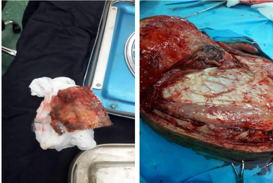
Figures 1 (A) and (B). Insertion of a silicone mesh between the dura and the muscle during craniotomy.

cranioplasty, which shows neither bleeding from the muscle, nor adhesions between the muscle and the dura.