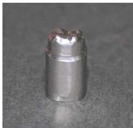
Figure 2. Steel die