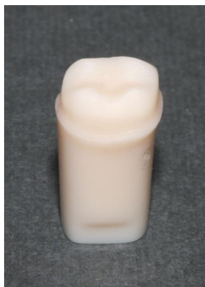
Figure 1. Preparation of resin tooth

Finally, the fabricated veneer was cemented on the fabricated framework using Panavia F2 (Kuraray, Japan) resin cement as follows: The internal surface of the veneering and the external surface of the cores were sandblasted with 50 \mu alumina particles at a pressure of 2 bar (Basic mobil – Renfert – Germany). Next, the internal surface of the veneers was etched with 9% hydrofluoric acid (Ultradent, Germany) for 60 seconds. After rinsing with water, they were immersed in ethanol 100% (Wilmar, Australia) for 5 minutes and placed on a vibrator. After that, they were rinsed with water again and air was sprayed for 20 seconds.