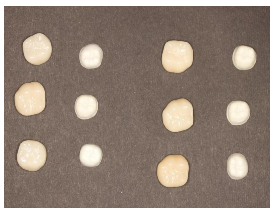
Figure 3. Cores and veneers milled by the rapid layer system