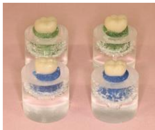
Figure 4. Fixing metal dies over cylindrical rods

The entire cementation process was performed by one operator. Glass ionomer cement was mixed with a plastic spatula for 20 seconds and spread on the internal crown surface using a disposable applicator. The crowns were placed over the dies and held in place by uniform finger pressure for 10 minutes. The assembly of the crown and metal die was stored in water at 37°C for 48 hours. Prior to load application, the samples were thermocycled for 1000 cycles between 5-55°C (TPO, Nemo, Iran). To stabilize the samples for fracture resistance testing, metal dies along with their restorations were mounted in polyethylene cylindrical rods based on their color (Figure 4) (12,21).