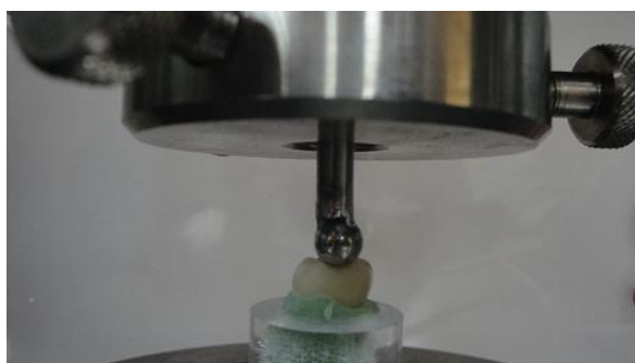
Figure 5. Load application to samples

A cylindrical rod with 6 mm diameter was used to obtain a three-point contact on the occlusal surface of restoration for load application until restoration fracture. The load was applied at a crosshead speed of 0.5 mm/minute. The load at failure was recorded as the fracture load. The mode of fracture was also determined visually and recorded.