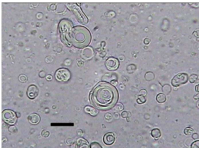
Fig1. Micrograph (40×10 magnifications) of zinc sulfate niosomal formulation composed of Span 60/cholesterol (70/30 molar percent); Scale bar = 5 \mu\text{m} .

Multilamellar vesicles (MLVs) were formed as depicted in Fig. 1. Mean volume diameter of Span 60 niosomes was 6.84 \pm 0.21 \mu\text{m} , 48 h after preparation. Size distribution curves of prepared MLVs (Fig. 2) showed high physical stability of niosomes.