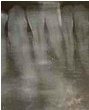
Figure 2. Periapical radiograph of the patient showing intact alveolar bone