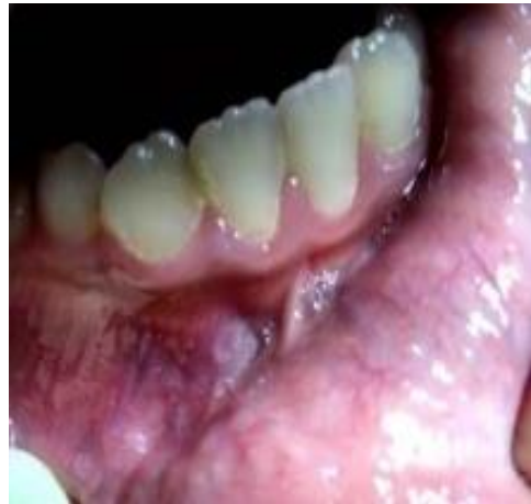
Figure 5. No sign of recurrence after 15 month (×40)