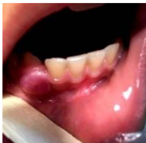
Figure 1. Clinical examination of tumor mass revealed a lesion located in the right gingival mucosa at the canin teeth.

Currently, the patient is under regular follow-up and there has been no evidence of recurrence during the last 15 months (Figure 5).