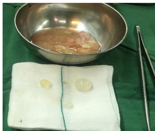
Figure 3. multiple ruptured and intact hydatid cysts

The patient had an uneventful postoperative course and was discharged on the 6th post-operative day. Albendazole treatment that had been started one week preoperatively was continued for six months postoperatively. The patient was asymptomatic and there was no recurrence in serial echocardiographic evaluation during the one year follow-up period.