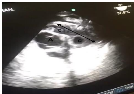
Figure2. Transesophageal Echocardiography two large cysts (c) in the posterior of aorta (A)

After tamponade surgery, complete reevaluation was done. Later, it was found that the patient and her family had six sheep dogs in their house. Repeated echocardiography (transthoracic and transesophageal) confirmed persistent cystic mass inside the pericardial cavity. There were two relatively large hydatid cysts; the biggest one (5cm diameter) was in the lateral side of the left atrium, and the other one (2.5cm diameter) was in the inferior of the ascending aorta (Figure2).