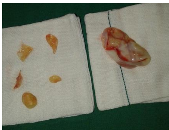
Figure 1. Multiple hydatid cysts

After emergent surgical consultation, due to tamponade, the patient was immediately transferred to the operation room and through subxiphoid approach, 300cc exudative fluid was drained. The fluid appearance was turbid and purulent. Surprisingly, we saw one large already ruptured cystic mass (5*3.5*1.5) and multiple small cysts that were suspicious to hydatid cysts (Figure1). Immediately following drainage, systole blood pressure increased from 60 mmHg to 110 mmHg.